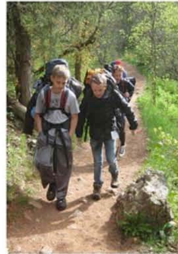
On the Appalachian Trail

Scouts in Troop 50 attain Eagle Scout at nearly 5 x the national average! And they have fun while learning valuable life skills and lessons!